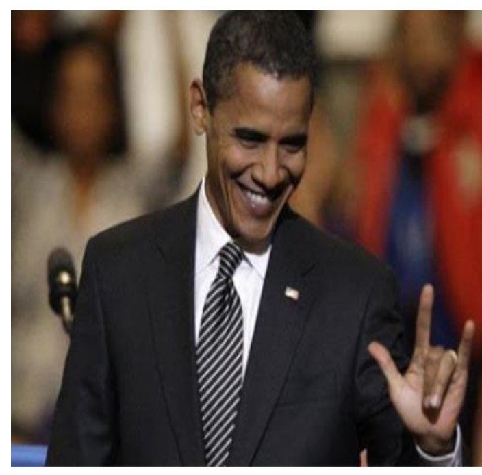
Barack How The Illuminati Made Obama President