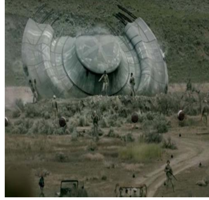
X-Files Creator I Thought the Production Would be Shut Down by the Feds, Too Close to the Truth