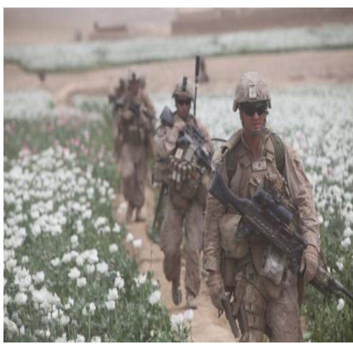
The Afghanistan Deception Fighting for Opium