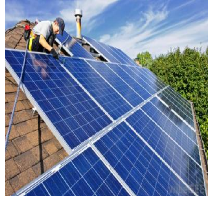
Solar Power Nevada Just Killed the Solar Industry with 40 Percent Tax Hike Derailing the Off Grid Movement