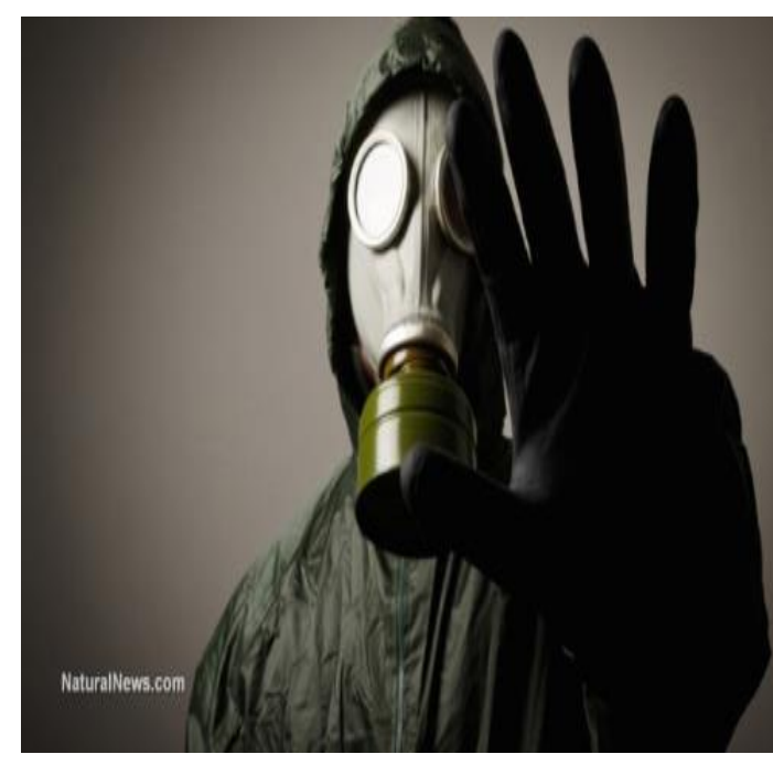
US Government Locked Black Soldiers In Mustard Gas Chambers In Racist Human Experimentation