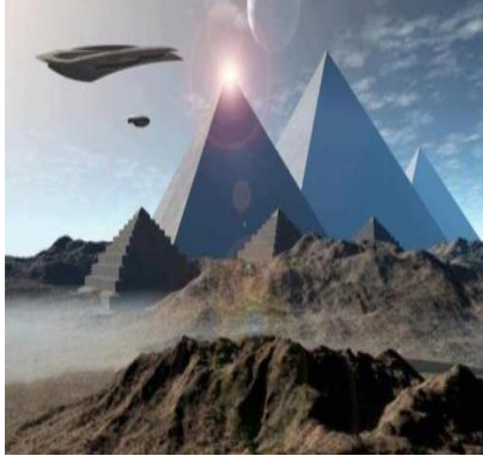
Unidentified Flying Objects The Reality They Cover Up And The Truth