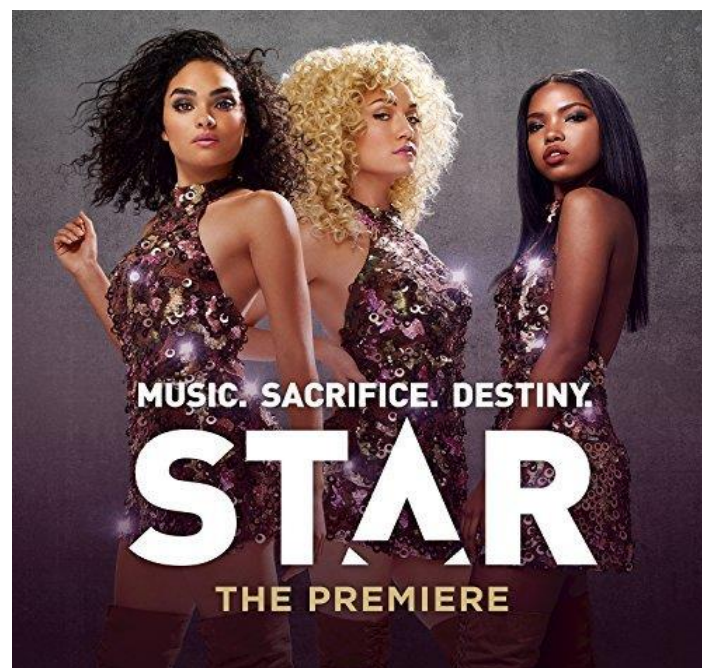
Star (FOX TV Series) Becoming a Stripper Can Make Your Dreams Come True