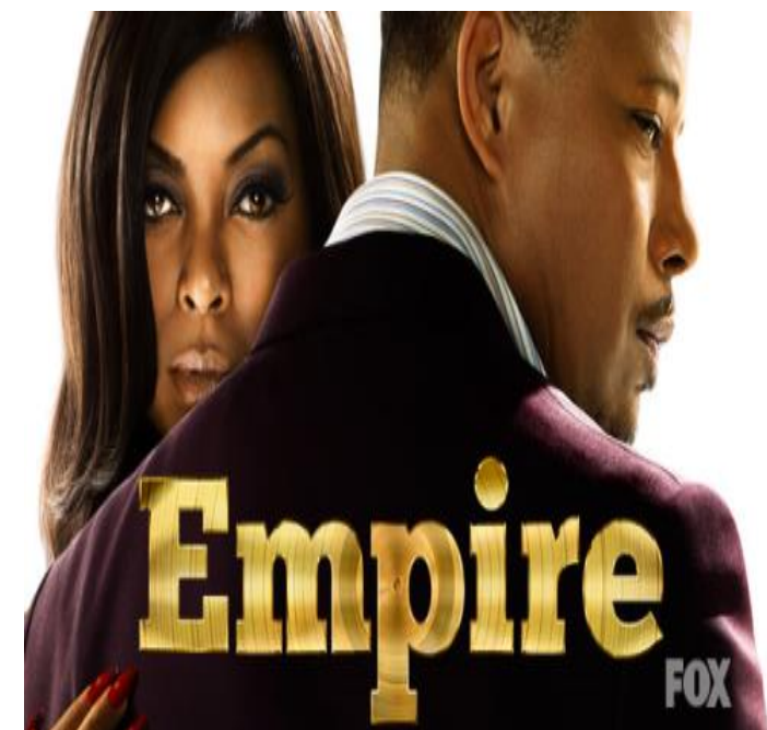
Empire TV Series Illuminati Propaganda