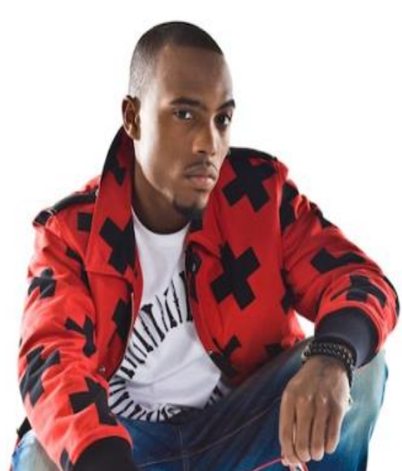
Rapper B.o.B Exposes Illuminati Cloning