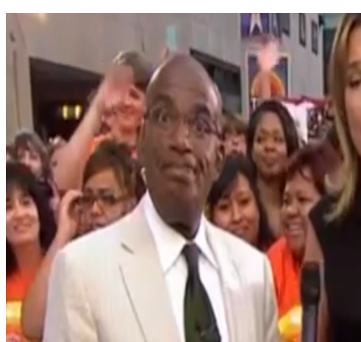
MK Ultra Glitches On Live TV