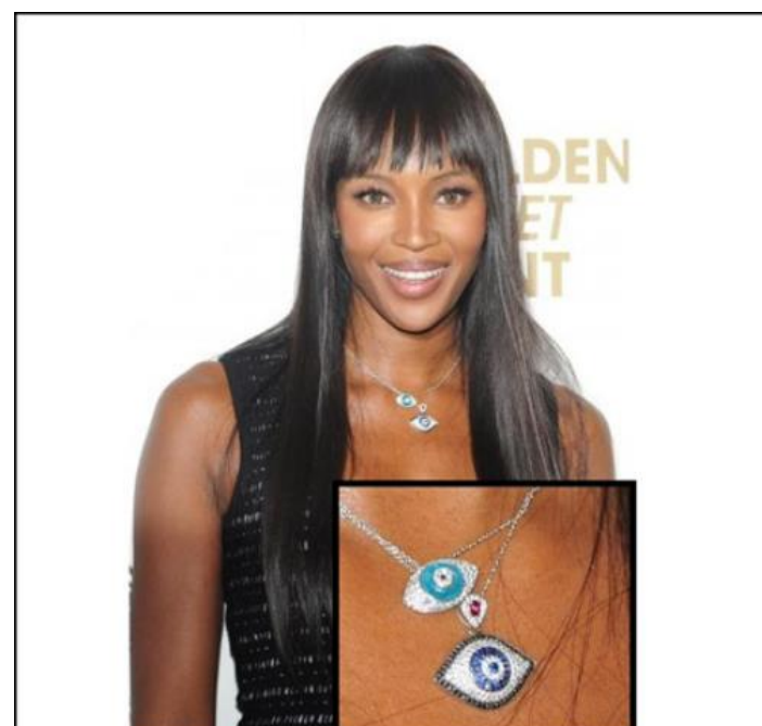
Naomi Campbell LIVING Illuminati Style