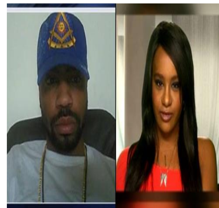
Bobbi Kristina Cousin Gives Interview About Her Condition Wearing Freemason Hat