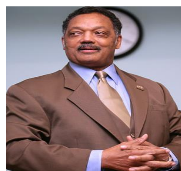
Jessie Jackson The Freemason How Can You be Christian Preacher and a Satanist?