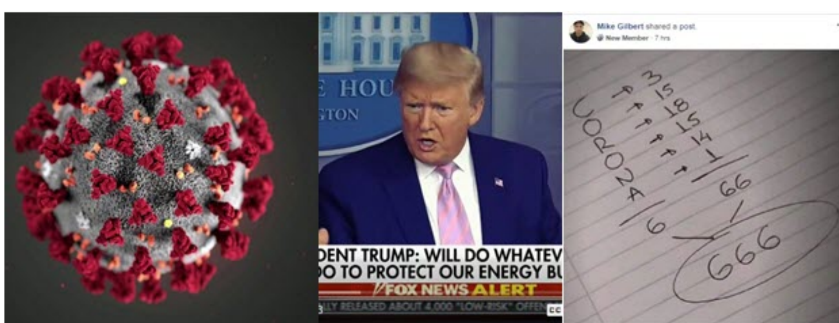
Figure 3. President Trump: the Antichrist, the man who made a covenant with many 'to make America great again', in 2016, 49 years after the command to restore Jerusalem was issued on June 28 th 1967, and thus the beginning of the tribulation, according to Dan. 9:24-27. He is also the Corona Beast: Donald Trump is the man who merged with the machine and thus gave it life. CORONA is an AI entity that lies and confirms its lies as lies, just like its creator or father, Satan, the father of lies. CORONA = 666 [Article 1701: President Trump 2nd person of triune Anti-God].

The replacement of Kim Jong Un suggests that the machines, the dragon and 2 beasts, have now also taken over North Korea, which would suggest that this country will now begin to use the same epidemic lie on their population as the rest of the governments around the world have, by following the instruction by President Trump, who is the son of perdition [Article 1701: President Trump 2nd person of triune Anti-God]. Donald Trump is the man who made a covenant with many to 'make America great again' at the beginning of the tribulation, which began in 2016, and thus identified himself as the Antichrist and the first Beast (AI entity) of Revelation 13, whose number can be calculated to be 666. The dragon and the beasts are self-aware machines but machines nevertheless [Article 1726: Satan AI entity: Lucifer turned himself into a machine].