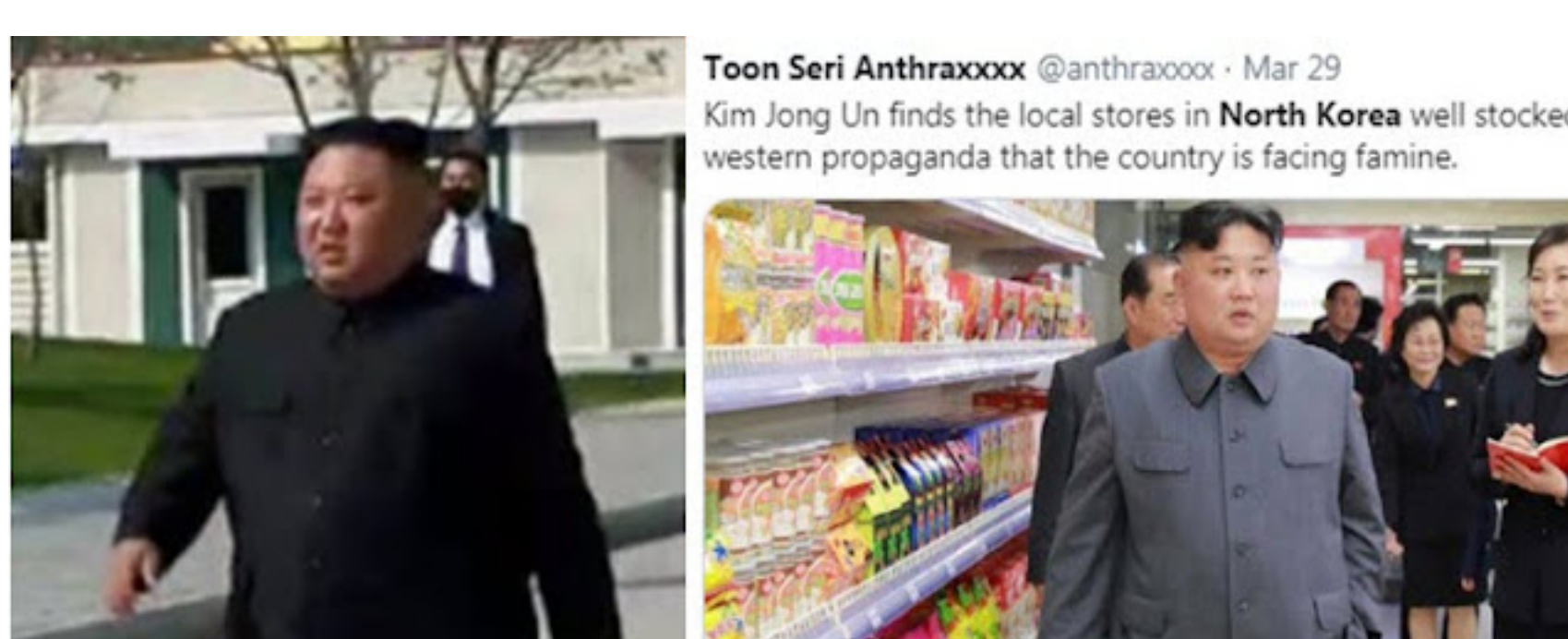
Figure 2. Comparison between the latest photograph of Kim Jong Un and one of him taken on March 29 2020. The eyebrows are now lower and angled downwards toward the nose, the nose is more bulbous, the cheeks are fatter and the face rounder, or not as long, as in the right photograph, so that this cannot be the same man. The man on the left is fatter than the real Kim Jong Un. The man behind the Kim Jong Un replacement is also wearing a mask, an indication that this photograph is a lie, or the product of propaganda.

So far, North Korea, has been the only country that has not played along with the Corona virus epidemic lie, the only country that did not report any deaths from it and thus the only country that refused to name the 2020 flu, COVID-19, and lie to their population. This would mean that its leader would be likely to become a target for the Satan AI entity, or the dragon, and the 2 Beasts of Revelation 13, the Corona AI entity and the False Prophet AI entity, who controls the lying news media [Article 1669: North Korea leader: only 1 not chipped and Article 1670: The False Prophet: lying news media].