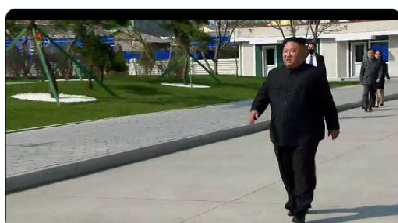
Figure 1. Photograph released by North Korea media apparently showing Kim Jong Un visiting a factory. It is strange that he seems to be walking alone as he is usually surrounded or closely followed by several people, which is another clue to the photograph not being of the real North Korean leader.

Deven_Intel @Deven_Intel · May 2 This is a picture from #NorthKorea's state owned KCTV of Kim Jong Un waddling around the Sunchon Fertilizer Factory & he attended a Ribbon-cutting ceremony.