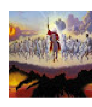
Figure 1. The final 7 year tribulation period ends with Jesus coming back riding a white horse as King of Kings and Lord of Lords.

As I have written in several previous articles we are now living in the time of tribulation, the final 7