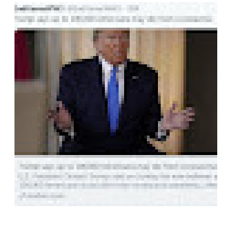
Figure 1 below shows a Twitter post about President Trump stating that 100 000 Americans could die of COVID-19, thus reiterating the same ridiculous lie that he has used to lock down the country and other countries around the world, through which he hopes to destroy the earth's inhabitants because ...