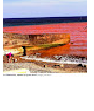
Figure 1 below shows red water off the coast of Devon, UK, on April 21st 2020. Incidents of blood red ocean water and blood red river water are increasing. As I have shown in previous articles, earth's oceans and rivers are fed by water coming from the Planet X planets and is energy depleted. The