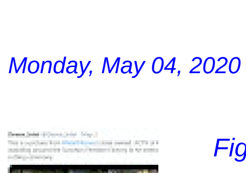
Figure 1 below shows an image of Kim Jong Un, leader of North Korea, who apparently resurfaced after a period during which it was rumored that he had had surgery and possibly died. The photograph would, therefore, seem to indicate that he did not die after all. However, careful examination of his fa ...