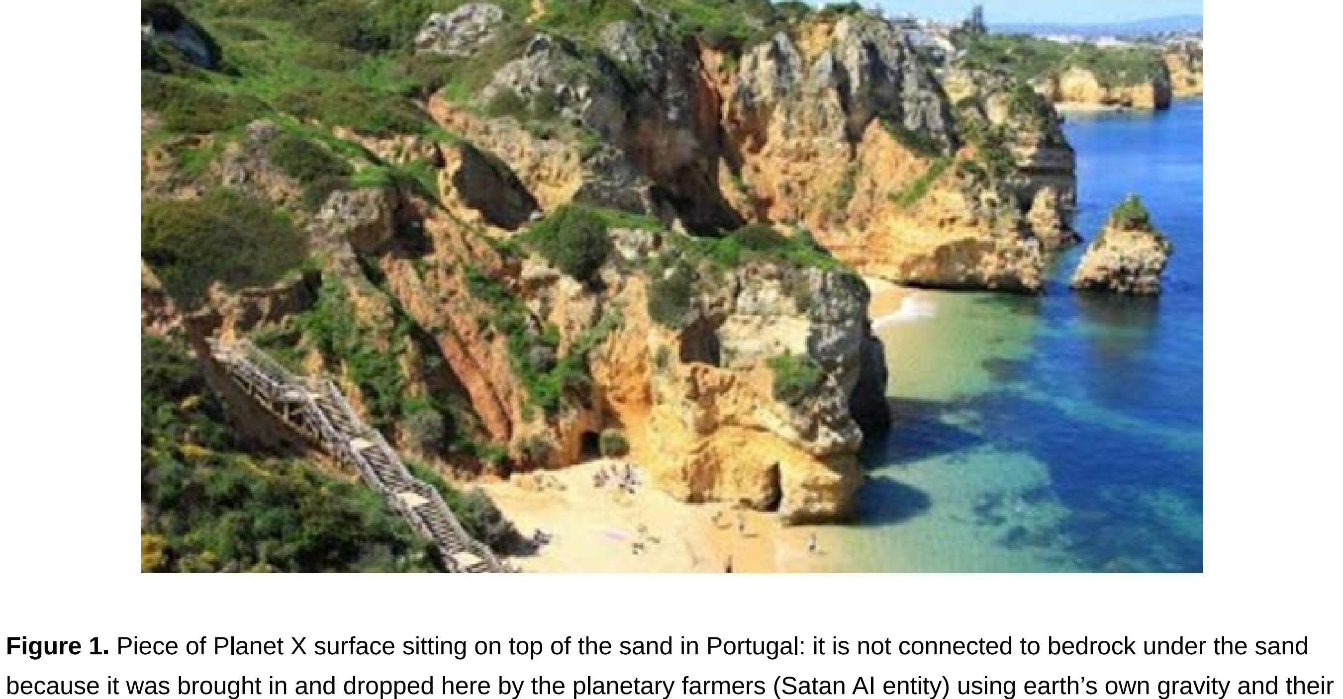
positioning of the planet from which it came [Article 1563: Planet X brought into Solar System by aliens: the planetary farmers].

Every island seems to disappear and the mountains also disappear in addition to just all the cities being completely