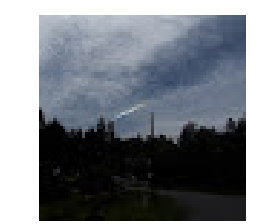
Figure 1 below shows a photograph of the sky over Puyallop, Washington, sent in by Mike, of the sky, on June 16 th 2020. The cloud is in the form of a two dimensional surface of clumpy cloud, which is an indication that it has formed on the surface of a Planet X planet, or what is left of it, since the planets ...