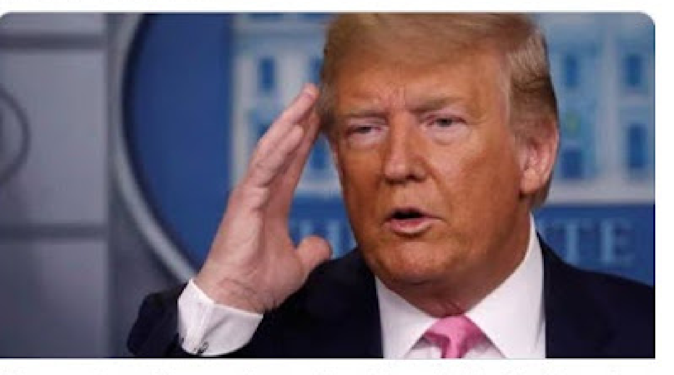
Trump replaces G7 coronavirus meeting at Camp David with videoconfe... The decision comes as nations around the world seal their borders and ban travel to stop the virus' spread. @jpost.com

The Jerusalem Post 🤣 @Jerusalem_Post · 36m President @realDonaldTrump will cancel an in-person meeting of G7 leaders at Camp David in June because of the #coronavirus and will hold a videoconference instead.