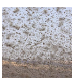
Figure 1 below shows a report by Strange Sounds on Locust plagues that have been affecting South America and talks about a huge swarm heading for Brazil and Uruguay. However, locusts are not flying insects, as they cannot seem to do much more than hop on earth; where they land, that is where the ...